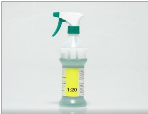
Multi-surface disinfectant and cleaner - Taski R2 - Plus Concentrated Hard Surface Disinfectant Cleaner 1:20