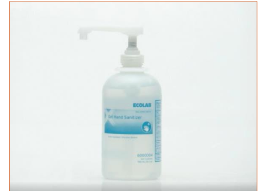
Hand Sanitizer - Ecolab® Gel Hand Sanitizer