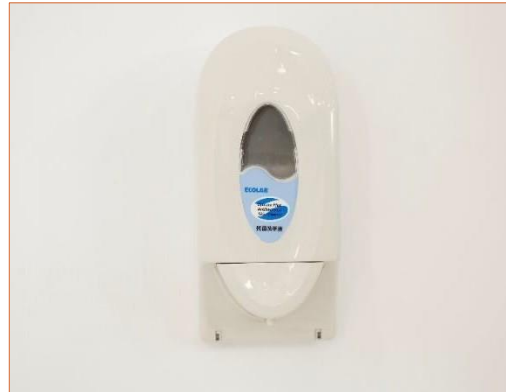
Hand Soap - Clear Antibacterial Hand Soap