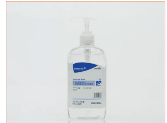
Hand Sanitizer - Soft Care Med Hand Sanitizer H5