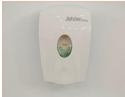
Hand Soap - Soft Care Bac Handwashing Cream with Bactericide