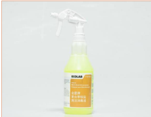
Multi-surface disinfectant and cleaner - Oasis Venus All-Purpose Cleaner and Disinfectant